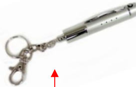
Key Chain Attachment